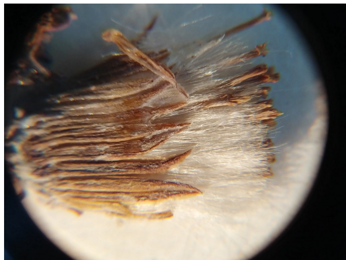
Photo: Senecio flaccidus (threadleaf ragwort) inflorescence

ASU has been hard at work preparing for the Range Plant ID Contest at the SRM annual meeting. We have a strong team of students assembled, three of whom have never been to any kind of SRM event before. The plant ID contest should be the perfect conduit to showcase the knowledge, networking and experiential opportunities available through SRM and hopefully garner more interest in the organization. We also have a ranch visit with a local rancher coming up soon, and several individuals from NRCS have volunteered to talk to us about monitoring at the ranch.