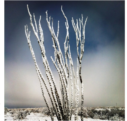
Santa Rita Experimental Range, February 2013